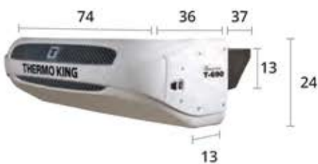
T-590R / T-690 / T-690 MAX