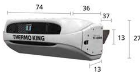
T-890, T-890 MAX, T-1090, T-1090 MAX, T-1090 SPECTRUM